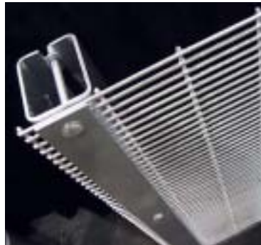
WELDED MESH "C" POST OVERLAP